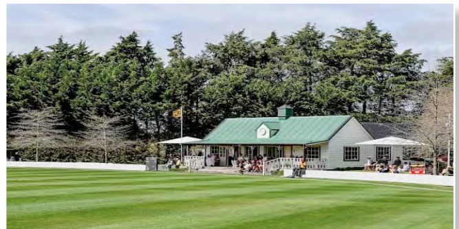
Willows Cricket Club

The 11 October is the starting week for all of our youth cricket teams, with cricket continuing through to 6 December for most teams.