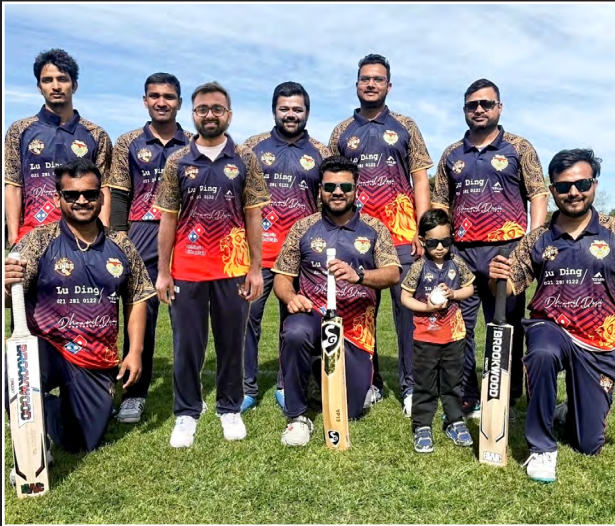
T20 Gujarat Kings

Both teams are in the process of getting kitted out, and with their new strips reflecting their new club and culture.