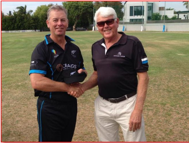
South African great Barry Richards

A highlight for me was getting to meet some of the true legends in the game of cricket. Getting my NZ cap from Barry Richards was huge for me. Another highlight was getting to spend some time with some top people in the NZ greater squad. It still a time I will never forget and it also brings it home to me that there is always something to strive for in this great game.