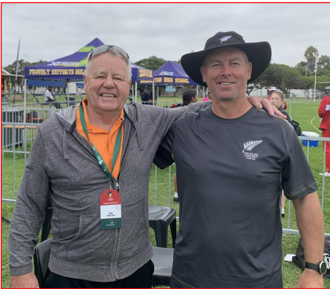
Mike Proctor one of the tournament's ambassadors