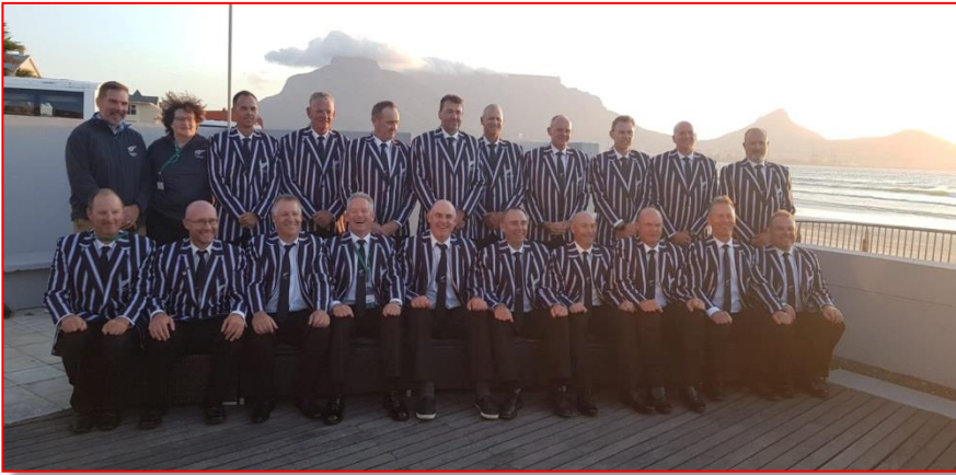
NZ Over 50's touring squad

We had the initial get together as well and this was hosted by the ambassadors for the tournament, some big names - Graeme Pollock, Barry Richards, Peter Kirsten, Mike Proctor, Dave Richardson and Omar Henry. A fairly prestigious lineup of past South African players. This was a time to meet some of the other teams and listen to some great stories from these legends of the game.