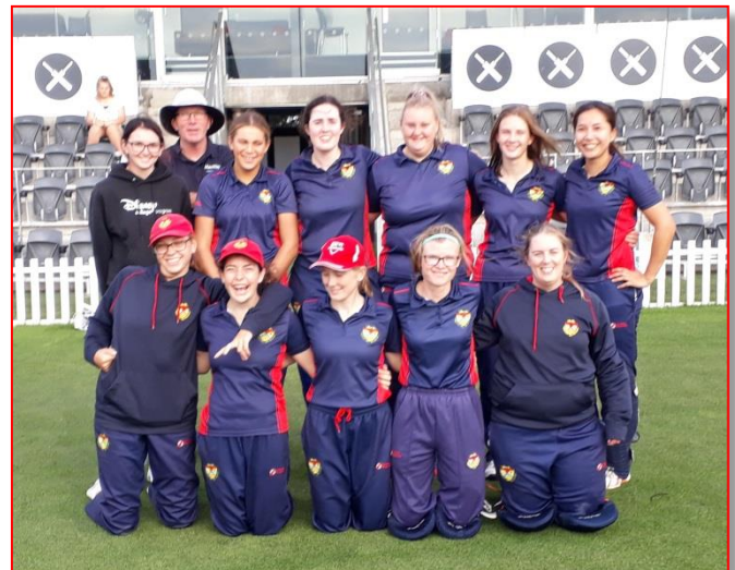
Premier Women after beating St Albans in the one day competition on Hagley Oval.

This season was a roller coaster for our premier women. We experienced our best placing (second) in the T20 competition and our lowest (fourth from four teams) in the one day competition. We showed glimpses of the potential in the team but didn't capitalise when it counted.