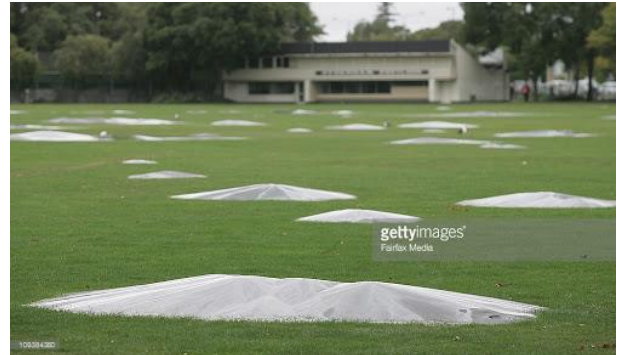
Sydenham Park in aftermath of the earthquakes

reconstructed with sand based drainage and we will get newly constructed properly layered soil, and clay based blocks on all four areas. We will also see new drains installed and new state of the art irrigation on the outfields and our playing and practice blocks.