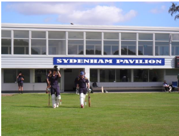
1st XI open the batting against Timaru Boys

With the second half of the high school cricket season about to get under way, we at South west youth cricket (SWYC) are calling around our players preparing them for practices and to see who is coming back to play. SWYC started the year with 7 teams and now it looks like we will be down to 6 teams for the rest of the year. Unfortunately this is typical of high school teams at this time of the year as players find employment on Saturdays, or work load at school has increased, exams etc.